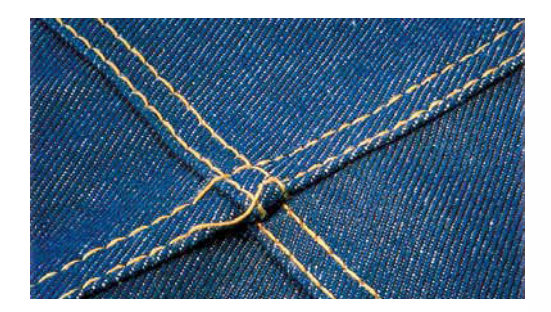
Skipped stitches - particularly when stitching over cross-seams

Skipped stitches and needle breakage often occur when the needle is heavily deflected when stitching over cross seams. The high penetration forces that occur when sewing medium to heavy materials (e.g. denim and work clothing) increase this risk even further.